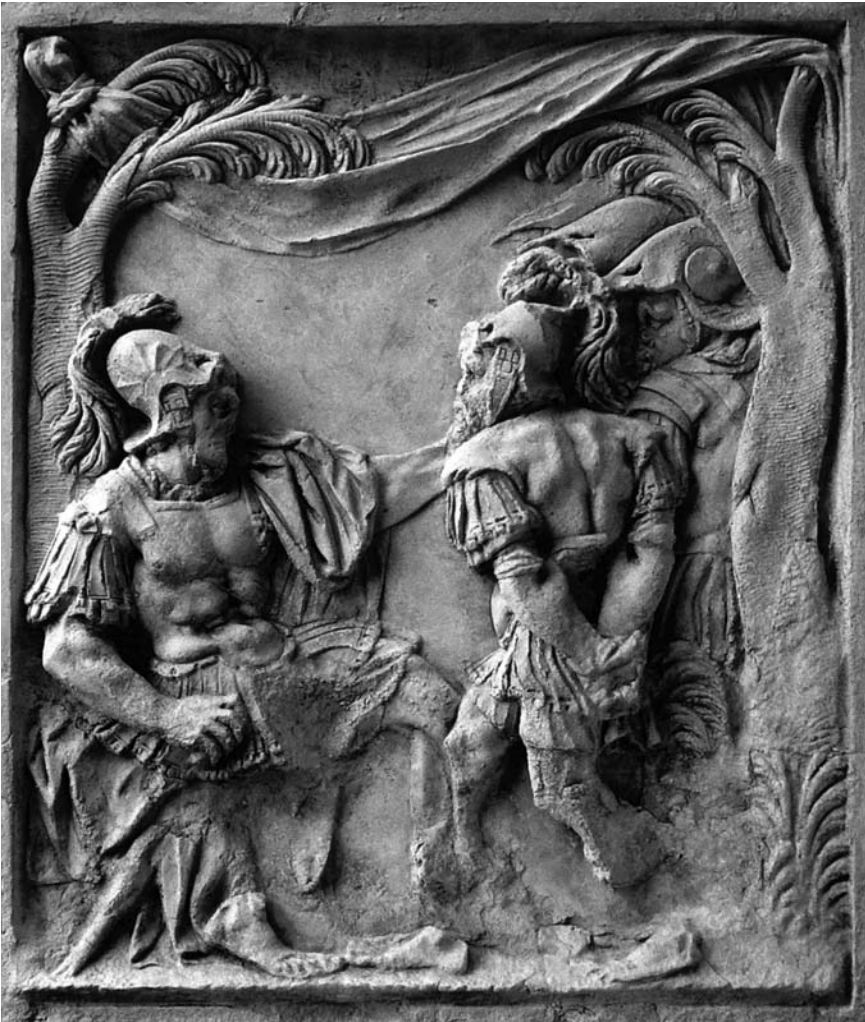
One of 74 sculpted reliefs decorating the Summer Palace (Belvedere) at Prague Castle, designed and constructed by Paolo della Stella (1538–63). Material analyses of the condition of the stone were supported by the European Preservation Program.